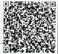
Principal Paramvir Albert Ekka Memorial College Chainpur Gumla, Jharkhand

This Receipt is to be used as proof of payment of stamp duty only for the document. The use of the same receipt as proof of payment of stamp duty in another document through reprint, photo copy or other means is penal offence under section-62 of Indian Stamp Act, 1899